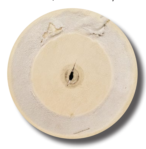
Cowhide 1,718 Abrasion Cycles