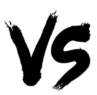
GoatSkin 2,580 Abrasion Cycles