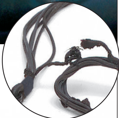
Enlargement of cord frayed by explosion