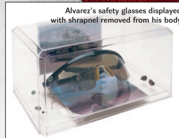
Alvarez's safety glasses displayed with shrapnel removed from his body