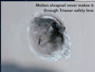
Molten shrapnel never makes it through Triwear safety lens