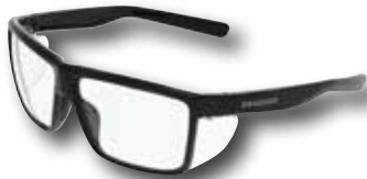
SR210 Clear Lens Duramass® Hard Coat