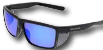
SR218B Blue Mirror Lens Duramass® Hard Coat