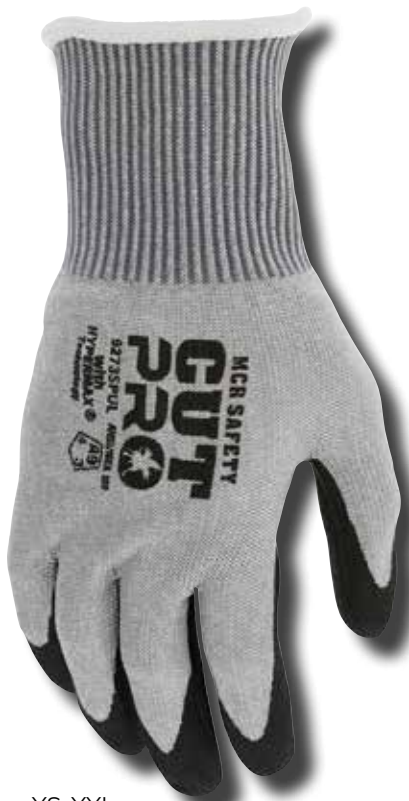
9273SPU Sizes: XS-XXL