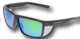
SR22BG Green Mirror Lens Duramass® Hard Coat