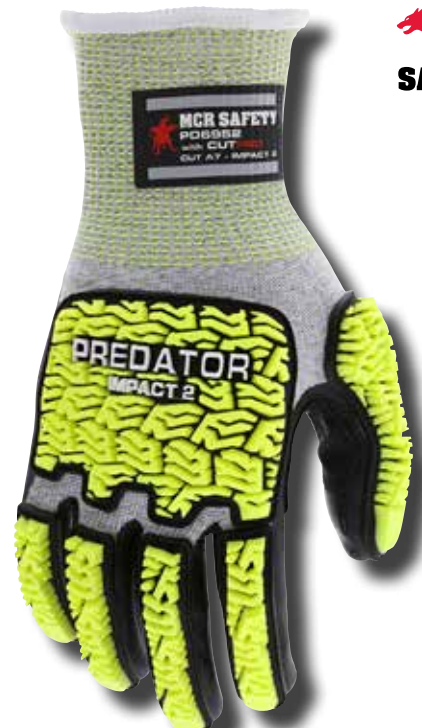
PD6952 Sizes: S-XXXL