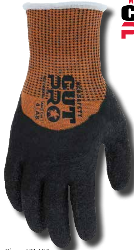
92743LT Sizes: XS-XXL