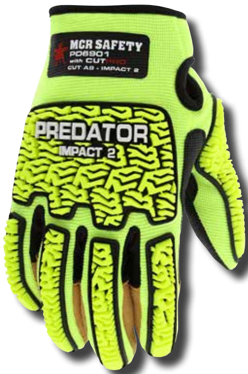
PD6901 Sizes: S-XXXL