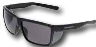
SR212 Gray Lens Duramass® Hard Coat