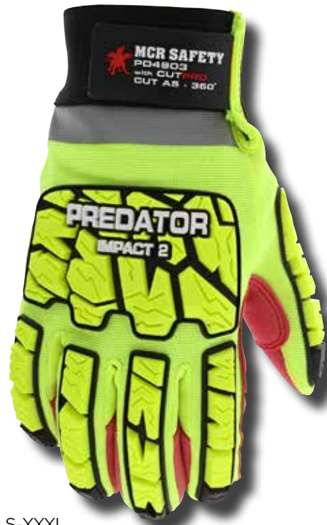
PD4903 Sizes: S-XXXL