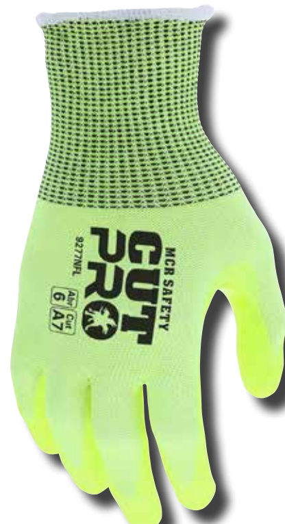
9277NF Sizes: XS-XXL