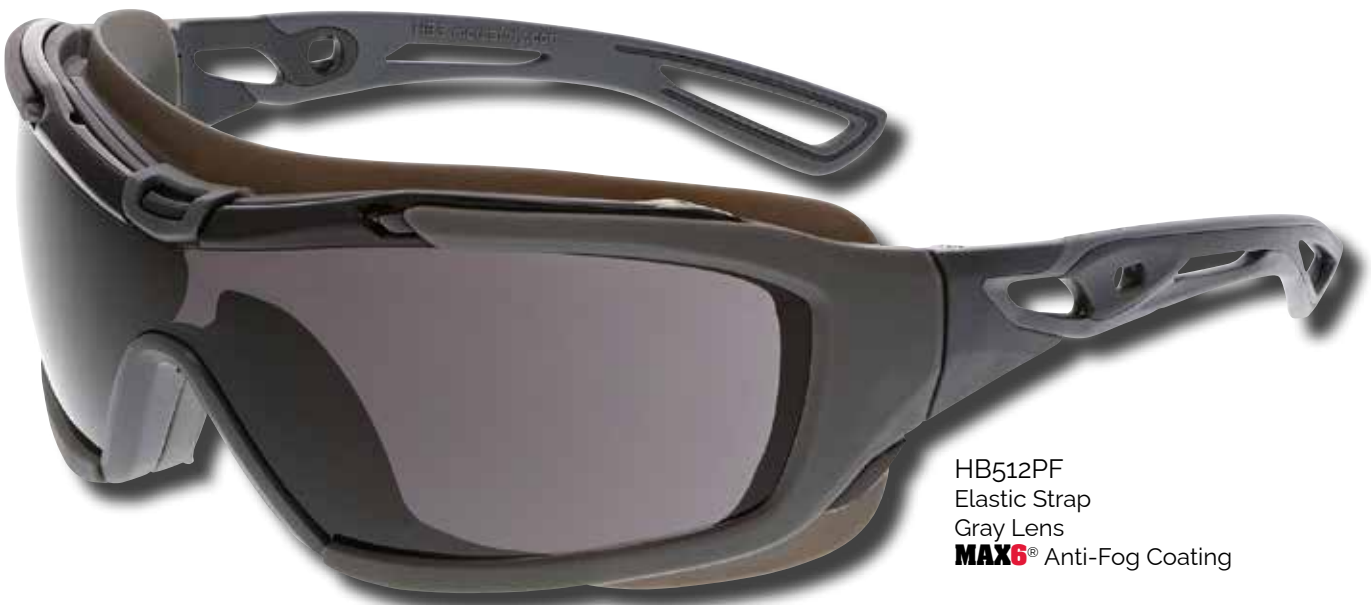
HB512PF Elastic Strap Gray Lens MAX6 ® Anti-Fog Coating