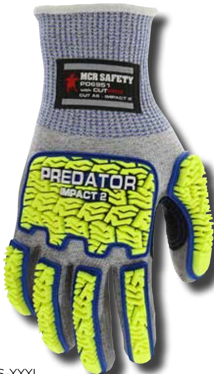
PD6951 Sizes: S-XXXL