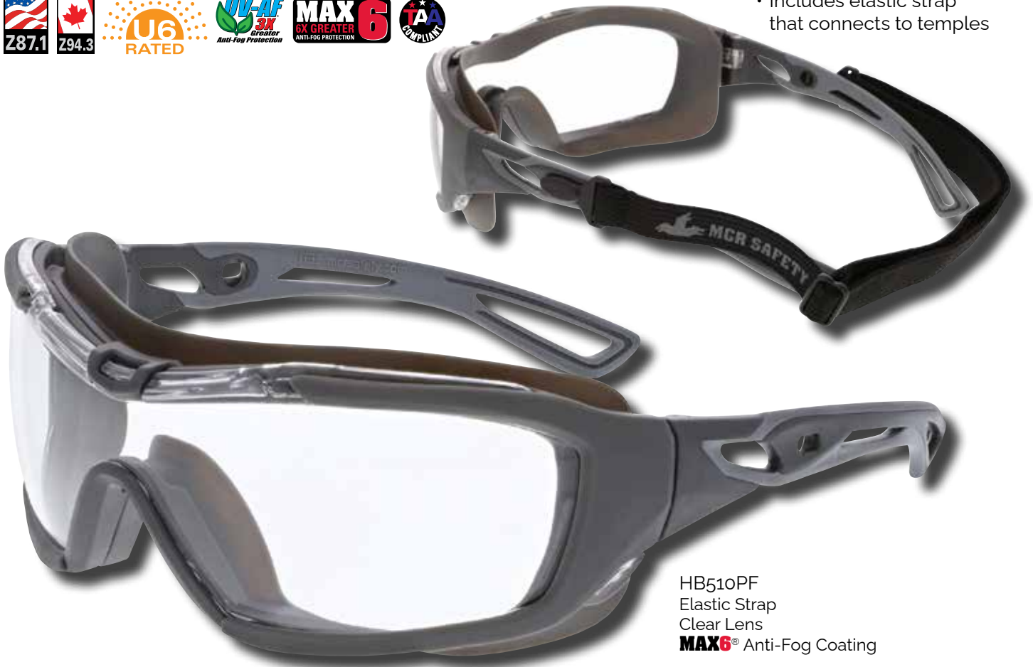
HB510PF Elastic Strap Clear Lens MAX6 ® Anti-Fog Coating