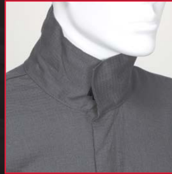
Stand-up Collar Option