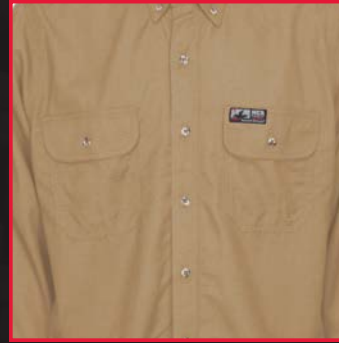
2 Chest Pockets