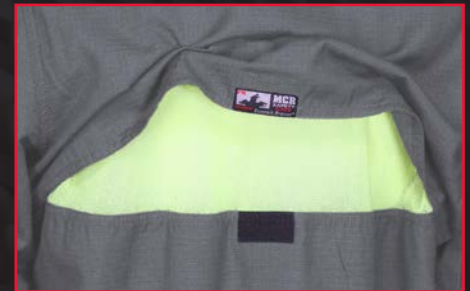
FR MESH BACK VENT