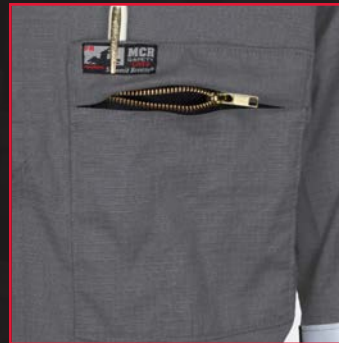
Zipped Chest Pocket