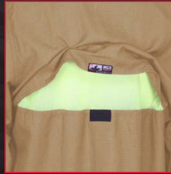
FR Mesh Back Vent