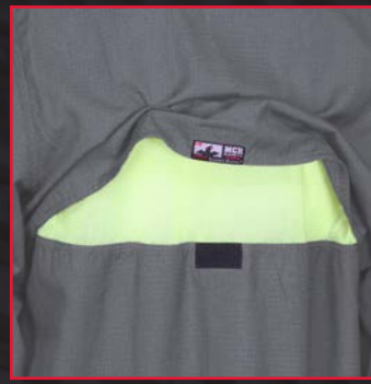
FR Mesh Back Vent