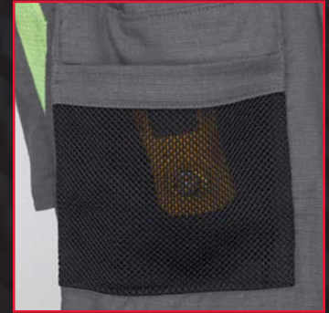
Mesh Gas Monitor Pocket