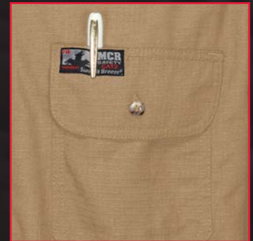
Front Pen Pocket