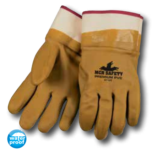
6710T Size: L Premium Foam liner, Tan Double Dipped PVC, Sandy Finish, Safety Cuff.