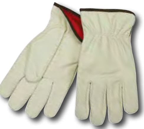
3750 Sizes: S-XL Red Fleece liner, synthetic split grain cow texture, keystone thumb, shirred elastic back.

3555 Sizes: M-XL Red Fleece liner, select grade grain deerskin, split deerskin back, keystone thumb, shirred elastic back.