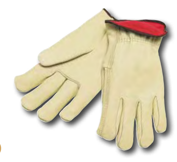
3255 Sizes: S-XL Red Fleece liner, industry grade grain cowhide leather, straight thumb, shirred elastic back.