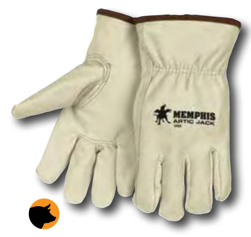
3460 Sizes: S-XL Thermosock® liner, premium grade grain pigskin leather, keystone thumb, shirred elastic back.

3452 Sizes: L-XL White Fleece liner, premium grade grain pigskin leather, straight thumb, shirred elastic back.