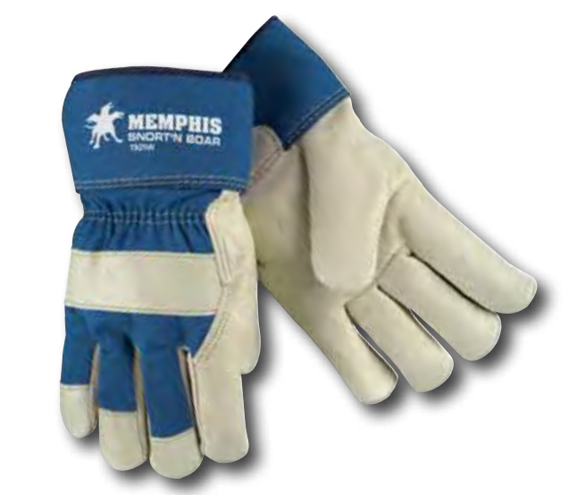
1925W Snort'n Boar™ Sizes: S-XL Wool liner, premium grain pigskin leather, 2.5" rubberized safety cuff.