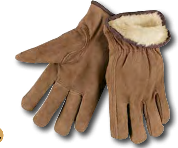
3170 Sizes: S-XXL Pile liner, premium brown split cowhide leather, keystone thumb, shirred elastic back.

3260 Sizes: S-XL Foam liner, select grade grain cowhide leather, straight thumb, shirred elastic back.