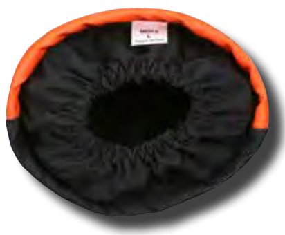
Close-up of the Inner Cuff available on all of these styles of insulated Gloves