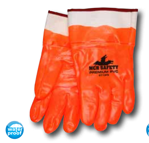
6710FS Size: L Premium Foam liner, Double Dipped PVC, Fluorescent Orange, Smooth Finish, Safety Cuff.

Foam and Polar Fleece Lined, Double Dipped PVC, Fluorescent Orange, Sandy Finish, 14" Length. Internal Knit Wrist.