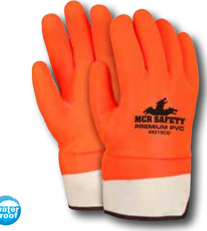
6521SCO Size: L Foam liner, Orange Double Dipped PVC, Sandy Finish, Safety Cuff.