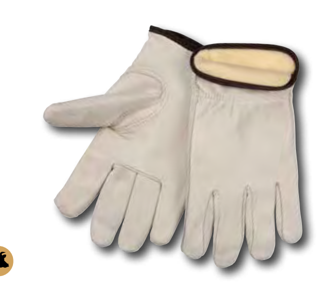
3266 Sizes: S-XL Thermosock® liner, industry grade grain cowhide leather, keystone thumb, shirred elastic back.