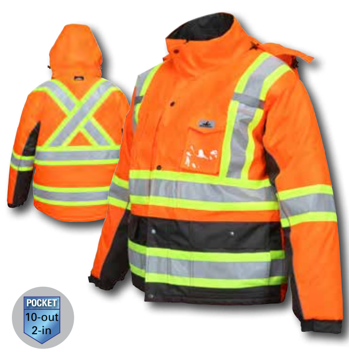
BPCL3L 4-in-1 Insulated Bomber Jacket Sizes: L-X4 Class 3, Luminator<sup>™</sup>, 4-in-1 Insulated Bomber Jacket, Zip Out Liner, Zip Off Outer Sleeves, 2" Vinyl Reflective Stripes.

ANSI/ISEA 107-2015 Type R Class 3 Compliant, Comfortable Quilted Liner and Stand Up Collar, Hi-Vis Fluorescent Lime with Shaded Torso And Sleeves, 2" Silver Reflective Stripes, Zipper Front Closure, Two Front Outer Pockets, Three Inner Pockets, Left Chest Cell Phone Pocket, Left and Right Shoulder Mic-Tab Holders, Black Shaded Torso Area, Detachable Drawstring Hood.