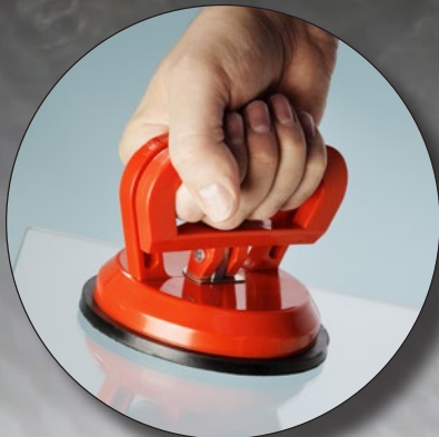
Vacuum Suction gives immediate and effective grip against wet and greasy surfaces